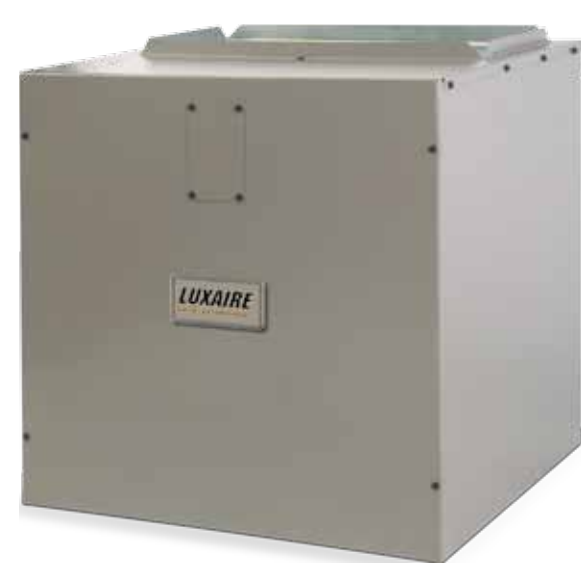
MA model shown